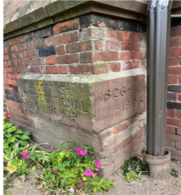
Cornerstone Faith Congregational Church 2030 Main St., Hartford, CT View: west